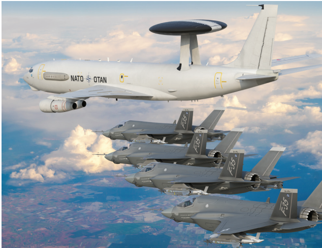
NATO Boeing E-3A Sentry escorted by Lockheed Martin F-35 Lightning II

operations. So they were very different because the security environment was different compared to that of the Cold War.