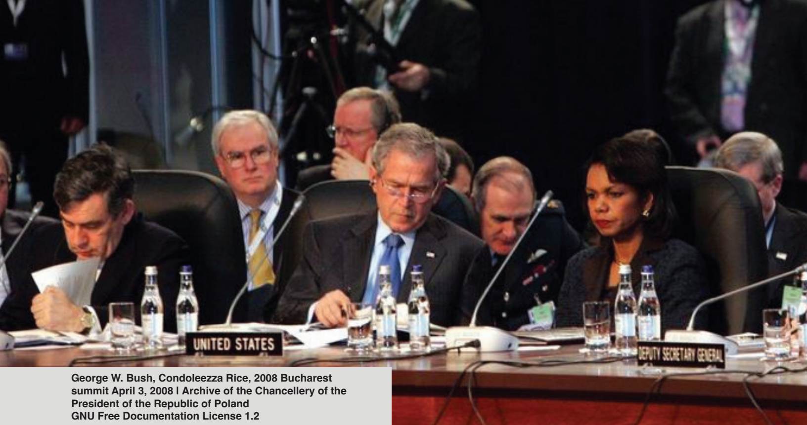
George W. Bush, Condoleezza Rice, 2008 Bucharest summit April 3, 2008

where Georgia and Ukraine were offered membership without a concrete timeline. So in what ways are these discussions being approached with an eye to avoid a 2008 scenario? Also, how does the wave of elections taking place across the transatlantic space in 2024 factor into the planning here?