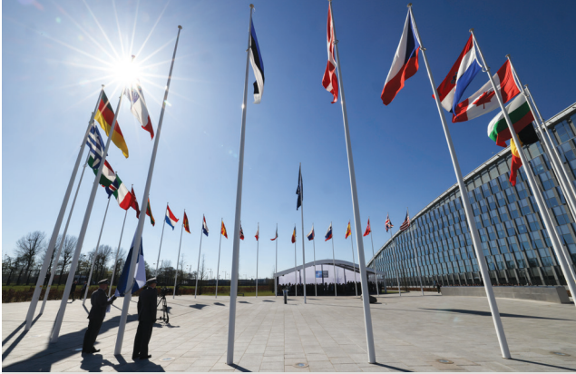
NATO soldiers prepare to raise the Finnish flag at the Meeting of NATO Ministers of Foreign Affairs at NATO Headquarters in Brussels, Belgium

FSR: It sounds like a very hands-on position and experience. Speaking of your experience, you really carry such a diversity of experience in your career. You have a background in Middle East studies; you wrote your doctoral thesis at Fletcher discussing the political participation of extremist armed groups; you then spent several years focusing on internal conflicts, counterterrorism, and peacebuilding; and now, for the past six years, you shape transatlantic security policy with NATO. How do you think about the path you've taken in the security field, and what lessons do you bring to your work at NATO?