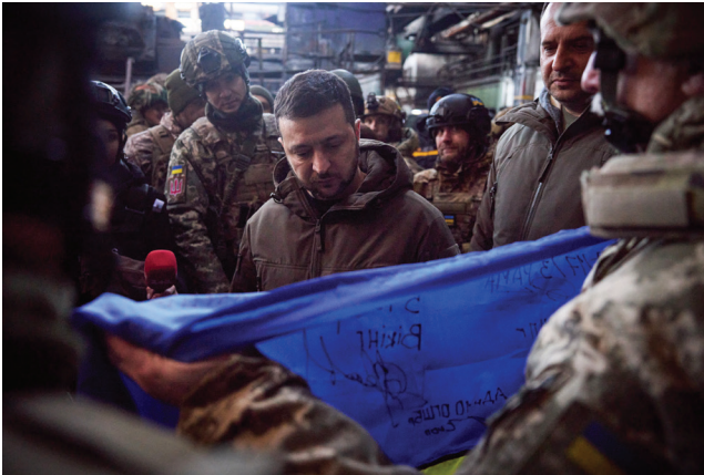
President of Ukraine met with the Ukrainian military in Bakhmut and presented state awards

Of course, I remember where I was. I think all of my colleagues do because it's one of those days where you get called into work—I think it was around 4:00 a.m.—when we got the notification that it had started and we had to come in. It's something that we all knew, unfortunately, was going to happen. It was a few nights of staring at the phone with this really sickening anticipation that something terrible was going to happen. I remember it quite well.