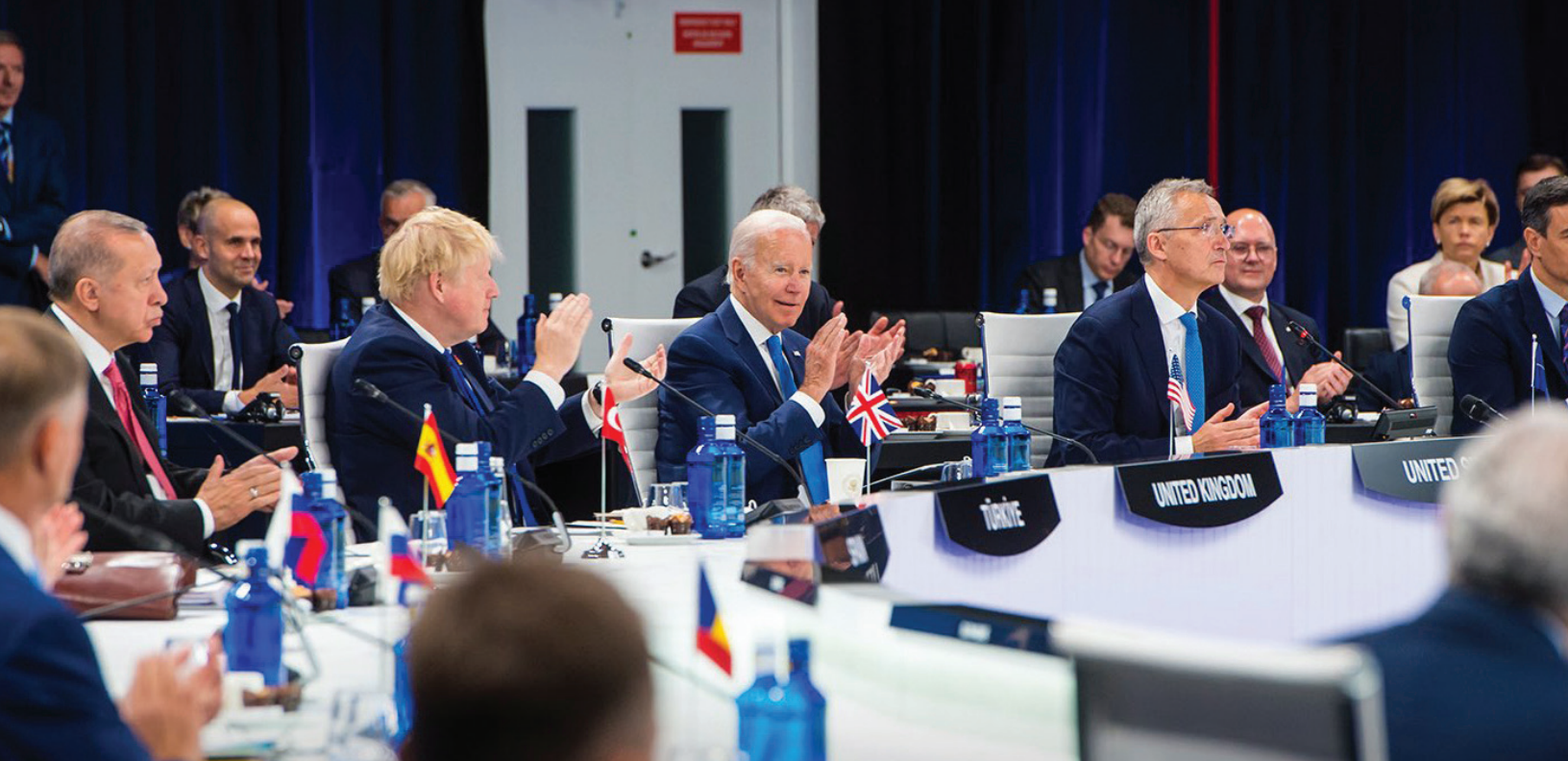
NATO leaders meeting at the 2022 Madrid Summit

that my prior field-based experience and work in different sectors has taught me to try to be as inclusive as possible, especially in the analysis stage, so that we are able to map problems in a way that doesn't just reflect our instincts and assumptions, but really tries to dig a little bit deeper. I try to bring that.