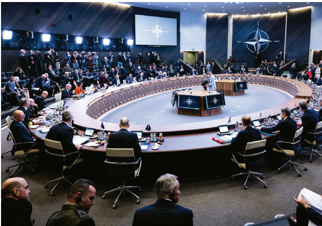
General View of the meeting Foreign Ministry of Estonia at NATO on 28 November 2023

There is also a very strong understanding that if Putin's war of aggression was to succeed in Ukraine, that would not just be destabilizing for the Euro-Atlantic area, but it might also send very destabilizing signals to other authoritarian actors—for example, in Beijing—and that could, in turn, bring more instability and more pressure against the international order. There is a strong understanding that it's first and foremost about Ukraine and its right to survival as an independent state, but there are broader implications for all of us.