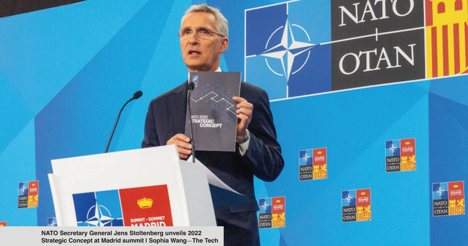
NATO Secretary General Jens Stoltenberg unveils 2022 Strategic Concept at Madrid summit

in which threats and challenges are quite difficult to tackle on a national-only basis. For us, it's making the case and showing that this is not just a nice thing to do, but this is good for your national security interests. So I think that's how we will approach it.