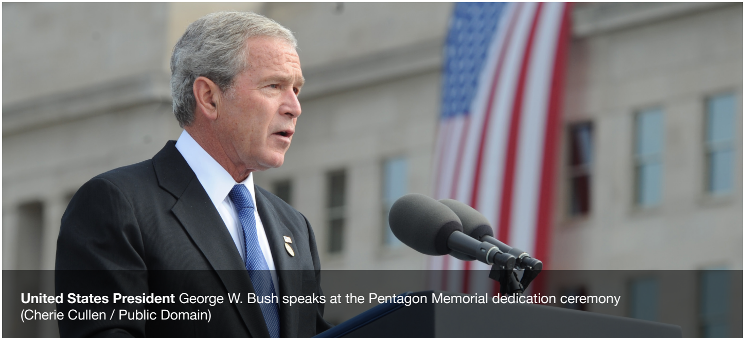
United States President George W. Bush speaks at the Pentagon Memorial dedication ceremony