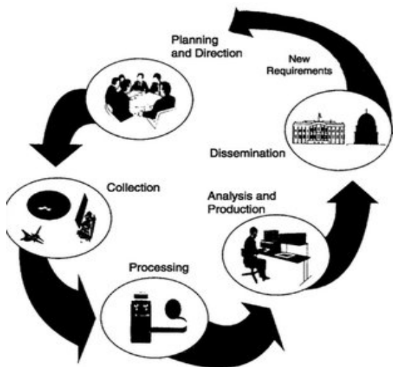
Figure 1: The Intelligence Cycle 10

Although this is a basic model, veteran Air Force officer Arthur S. Hulnick found numerous problems with the model that should be acknowledged. The first problem with this model is that policymakers usually do not ask for intelligence. Rather, intelligence personnel typically predict the needs of policymakers and take the initiative to find the information that is deemed necessary. In the next step of the intelligence cycle process, gaps of information will be filled once the process is underway. Some information will take months to find and the process is not neat and tidy. In fact, the process may occur in a roundabout way where parties communicate back and forth concerning information. Hulnick states that the real drivers of the intelligence cycle are intelligence managers who are usually operating parallel to policymakers. In many instances, information sharing does not occur between intelligence agencies and policymakers due to “information restriction, psychological barriers, fear of compromising sources, and security concerns.” 11 Intelligence personnel will often hold back the most pertinent and necessary information until the generic reports have been delivered to senior policy officials. For the most part, the purpose of withholding information is to high-